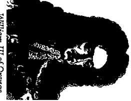
William III of Orange

Before William and his wife Mary could be crowned, they had to agree that Parliament was the lawmaking body in England—not the king. They also had to agree to ask permission from Parliament to gather an army. William and Mary had to accept this and several other acts passed by Parliament that became known as the English Bill of Rights. In this way, some traditional powers of the monarchy were revoked. The Glorious Revolution was a great victory for parliamentary powers.