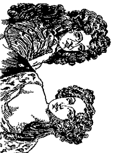
William and Mary

King William and Queen Mary ruled until 1702. Under their reign, England had a constitutional monarchy. A constitutional monarchy means that the king and queen could no longer rule without consent from the Parliament. Since some members of Parliament were elected by the people, this gave the people a say in their government.